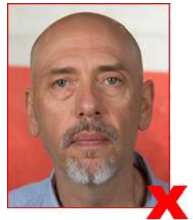
Background not plain