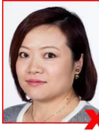
Side on to camera