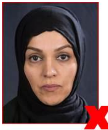
Background too dark