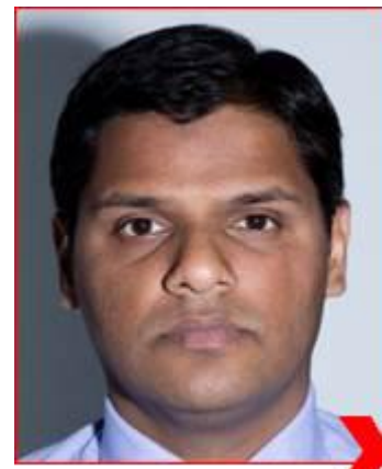
Shadows on image and background

© Photo Requirements | Australian Passport Office