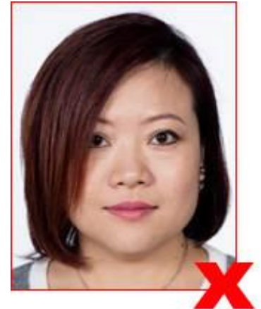
Hair obscuring face