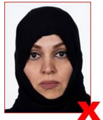
Eyes/edges of face obscured