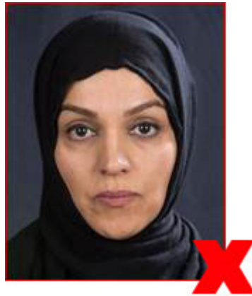
Background too dark