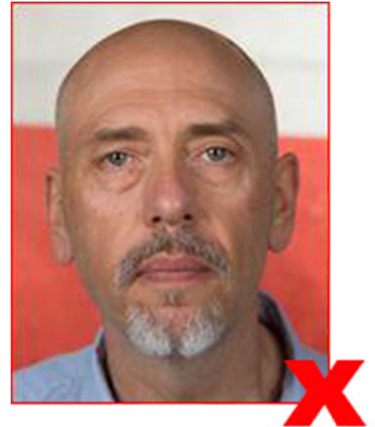
Background not plain